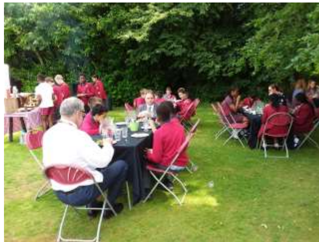
Year 8 enjoying the BBQ