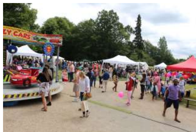
Having fun at the Summer Fete