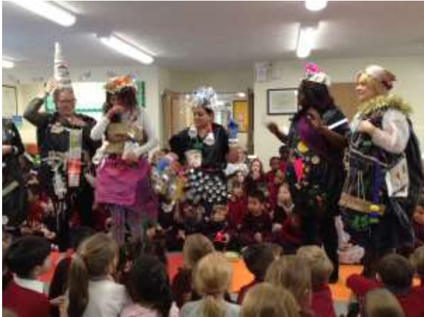
Pre Prep made dresses from recycled materials